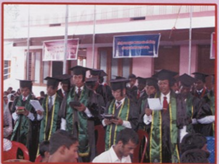
Sing unto the Lord