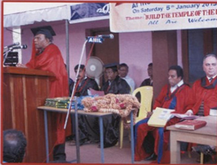
P. V. is addressing the Graduates

"BUILD THE TEMPLE OF THE LORD" (ZECH. 6:12)